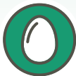
Eggs and egg products