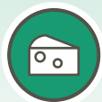
Soft and shredded cheese