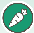
Cooked or sliced produce