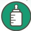
Opened baby formula