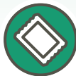
Dough and cooked pasta