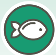
Meat, poultry or seafood products